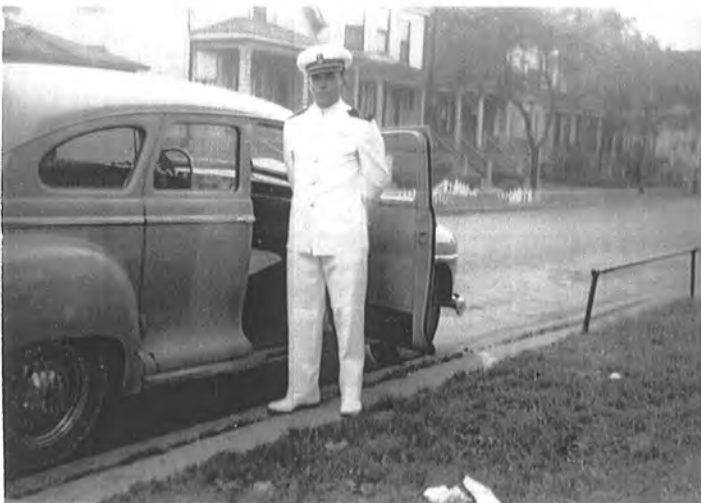
Outside home in Logan Square in Chicago, 1945